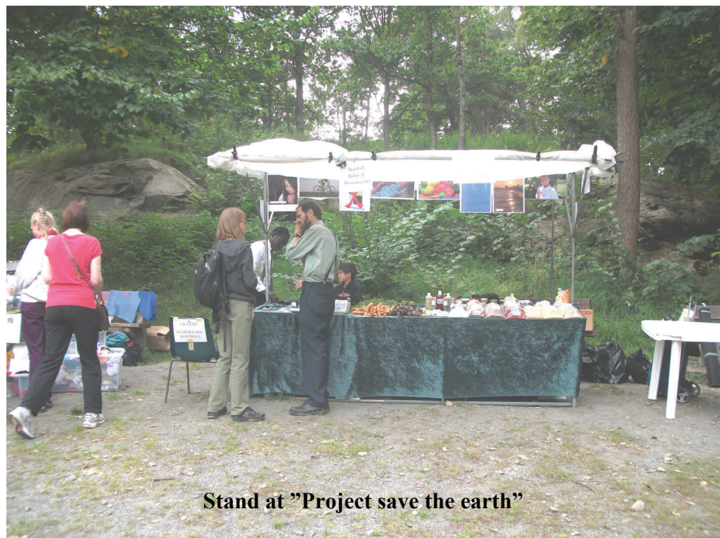
Stand at “Project save the earth”